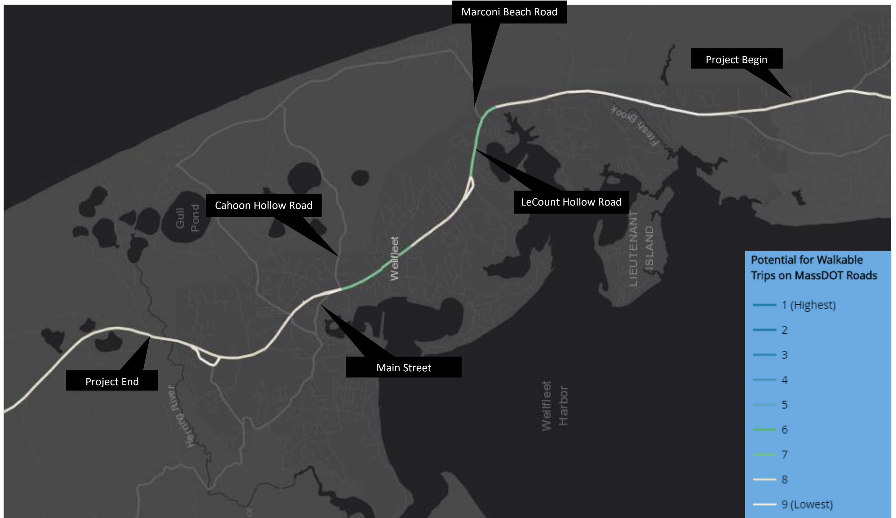
Route 6 – Wellfleet Pavement Preservation Project (MassDOT Project No. 609098) Potential for Walkable Trips