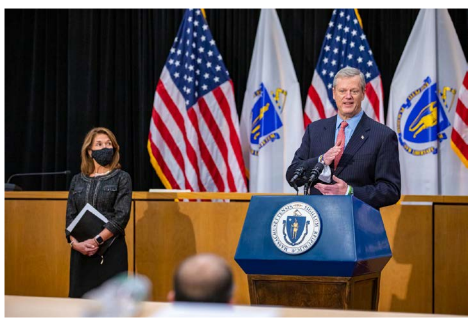
On Monday, the Baker-Polito Administration announced a series of targeted measures to disrupt an increasing trend of new COVID-19 cases and hospitalizations in Massachusetts. Learn more about this and other topics in this week's Command Center Situation Report.

The Command Center Situation Report is published weekly on Thursdays.