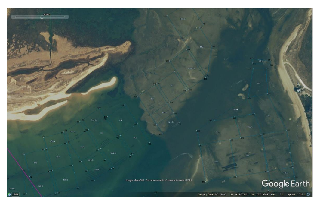
04/2005 Though this is not a low tide image, I thought the divide the creek makes on that part of Indian Neck is interesting.